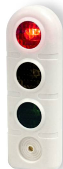
1.5' to the Sensor