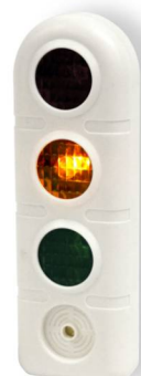
5' to the Sensor