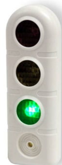
16' to the Sensor